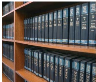
VETERINARY ALUMNI QUARTERLY, VOLUMES 1-3